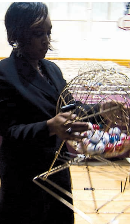
The lottery process in Waiting for "Superman" .