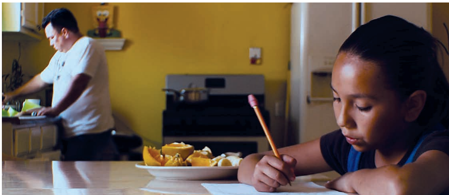
Daisy (right) and her dad.