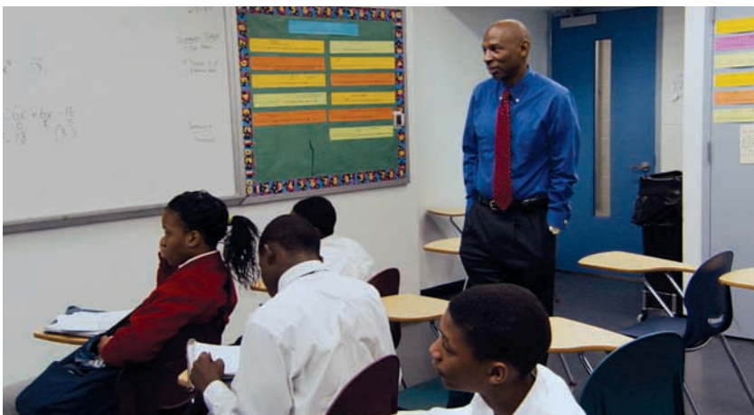
Geoffrey Canada (standing) with students.

Comprehensive programs for middle grades and high schools that combine research, a standards-based curriculum and extensive professional development to create positive and challenging learning environments. Both programs are run out of the Center for Social Organization of Schools at Johns Hopkins University.