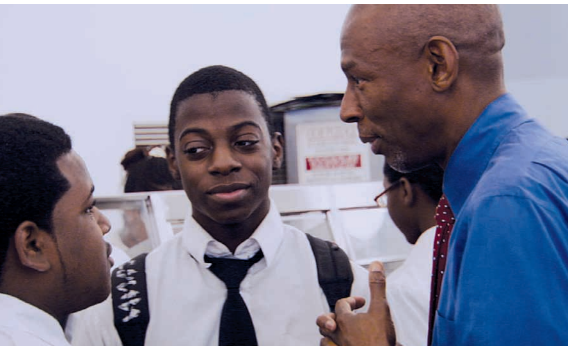
Geoffrey Canada (right) with students (left).

Parental Involvement: Decades of research point to the benefits of parents and guardians being involved in their child's education, including improved attendance, academic achievement and motivation, higher self-esteem and more positive in-school behavior.